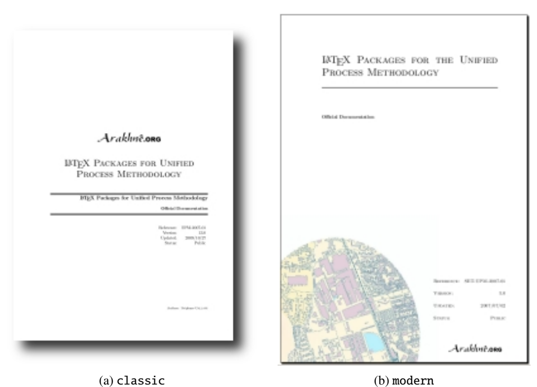
Figure 7.1: Front Page Layouts