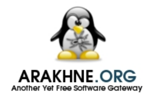
Figure 5.1: Example of figure inclusion with \mfigure